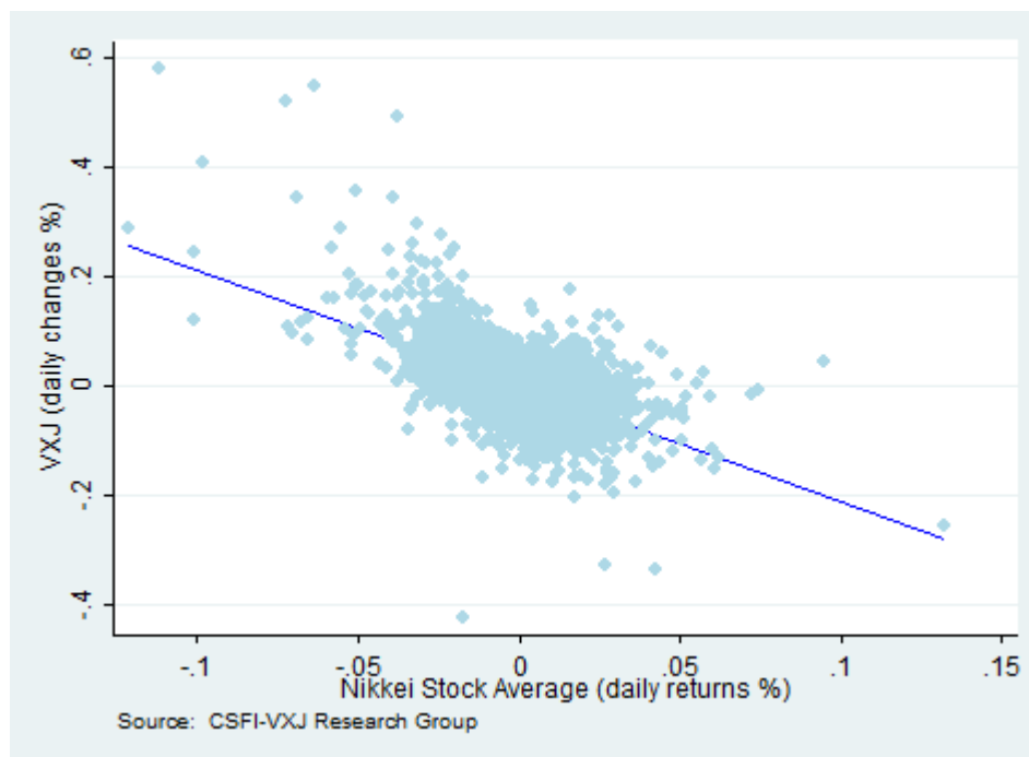
Figure 3. Scatter plot of daily market returns and changes in VXJ index (1998-2013)

Nikkei Stock Average is owned by Nikkei.